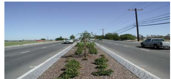
Simulation of After Construction Condition